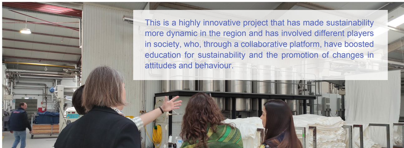
BlueProject, Bioeconomy, PeopLe, SUstainability, HEalth