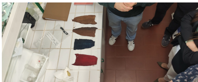
Photographs from the Project