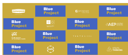
Get to know the partners