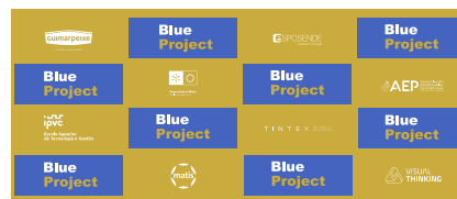
Get to know the partners